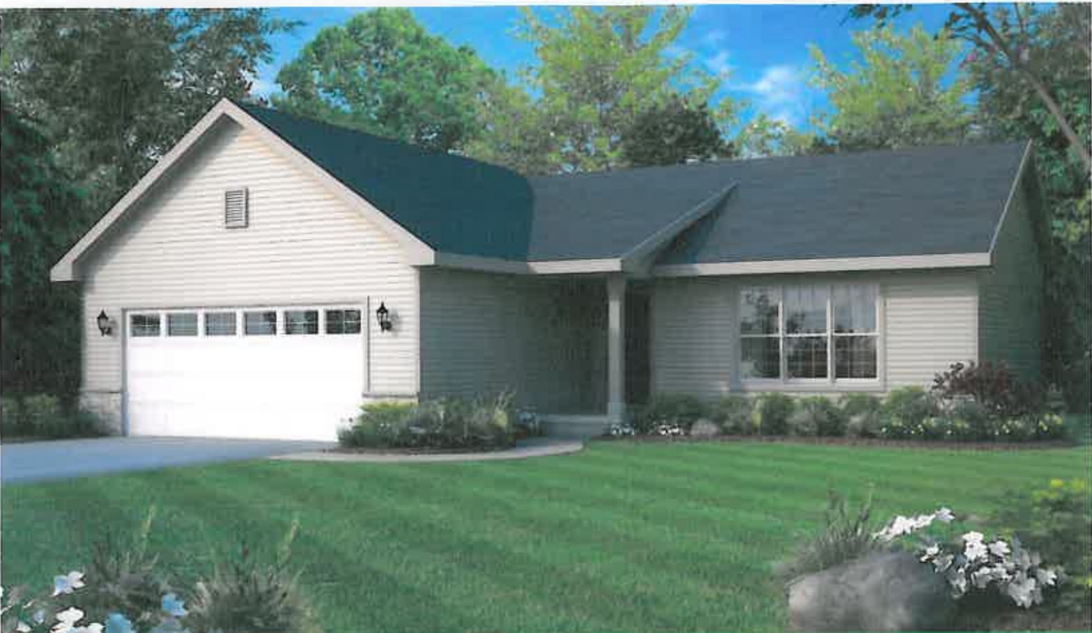
Ellison Model N214R

You're expecting guests and just spent all day cleaning the house. The kids are outside in the yard – but don't worry, they won't undo all your hard work. Using the garage entrance into the laundry room, they can remove dirty shoes and clothes so they don't track dirt through the house.